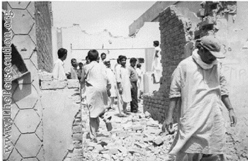
Another portion of demolished Prayer Center