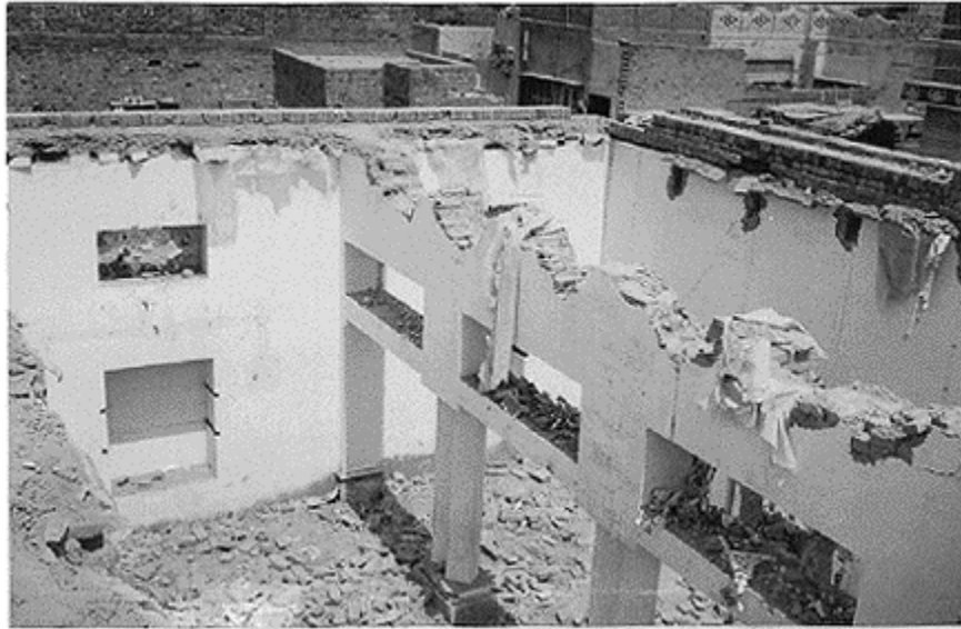
Hall of demolished Prayer Center